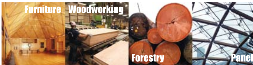
Circulation By Industry Total : 7,231 copies